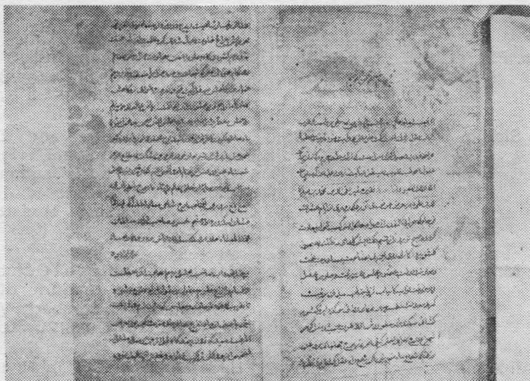
Fig. 1 : First page of the manuscript Mizan-ut-Taba-e-Qutub Shahi, (Acc. No. 266) is showing the name of the author.